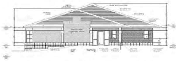
Community Centre Renovations

A review of our programming mix, registrations and revenue identified three pillars of our operations -- social enterprise, recreation and community building. Pillars that speak to the community we want to serve and the community we want to build.