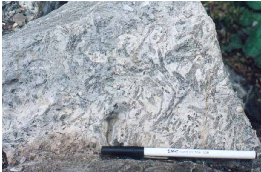
Photo 7. Location 2-b east, Quarry Road (SW off Brittany Drive). Randomly oriented branches (corallites) of colonial corals on a near-horizontal surface of bedding in limestone. 15 cm pen. Coral was probably broken and fragments transported by storm activity.